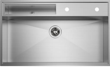
Sink Bernini 36" x 21" – U/M - (USA)